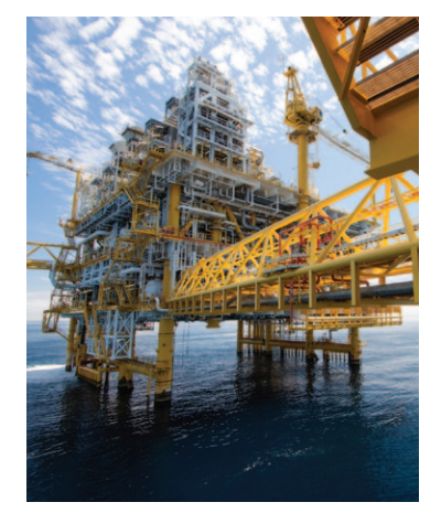
Viatran products are designed to promote oil rig safety at every turn, solving any problems that may occur quickly and easily – with maximum productivity and minimum downtime.

Viatran's substantial expertise in oil and gas allows us to provide outstanding solutions and support upon which you can depend for durable quality and fast service to keep your operation up and running efficiently.